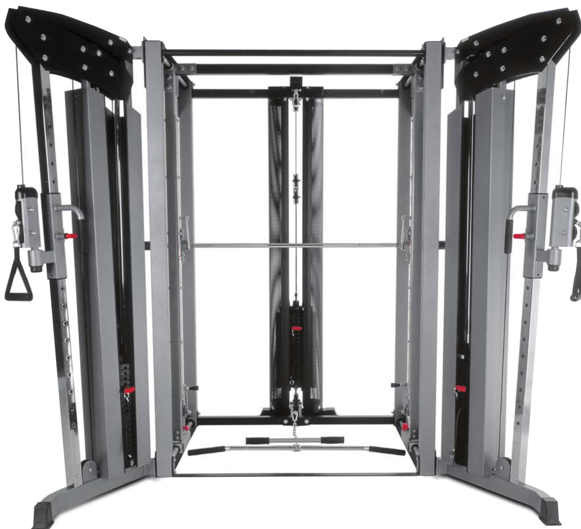
Shown with Optional Cable Crossover and Optional Lat/Row Attachments.