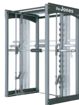
Jones Base Model Shown

* U.S. Patent No. 5,215,510, 5,669,859, 7,374,516 and 7,549,950 Other patents pending